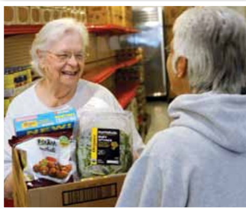
Our food pantries served approximately 30,000 people last year.

Education Creates Home and Opportunity (ECHO) is a school- and home-based