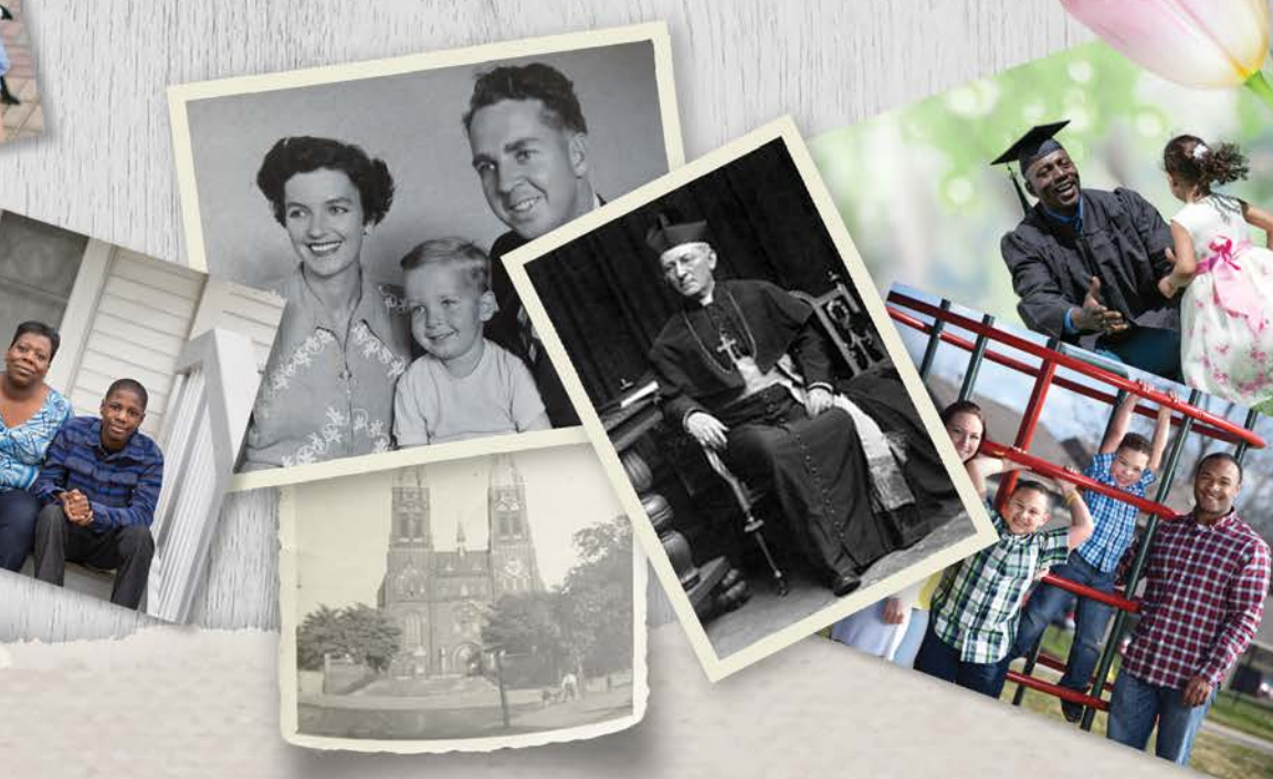
Begin resettling refugees from the Vietnam War